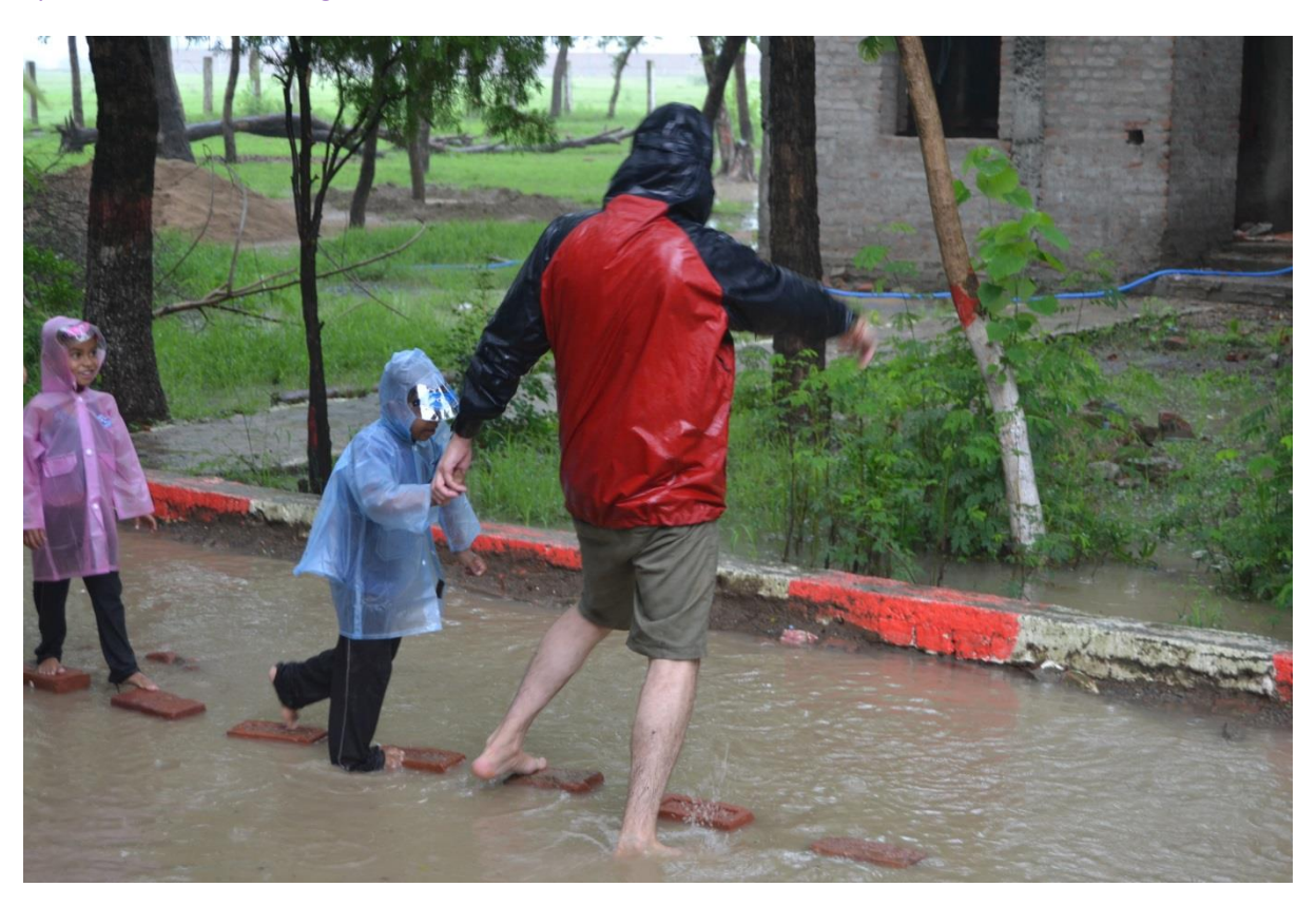
Learning to balance with handless UMBRELLA