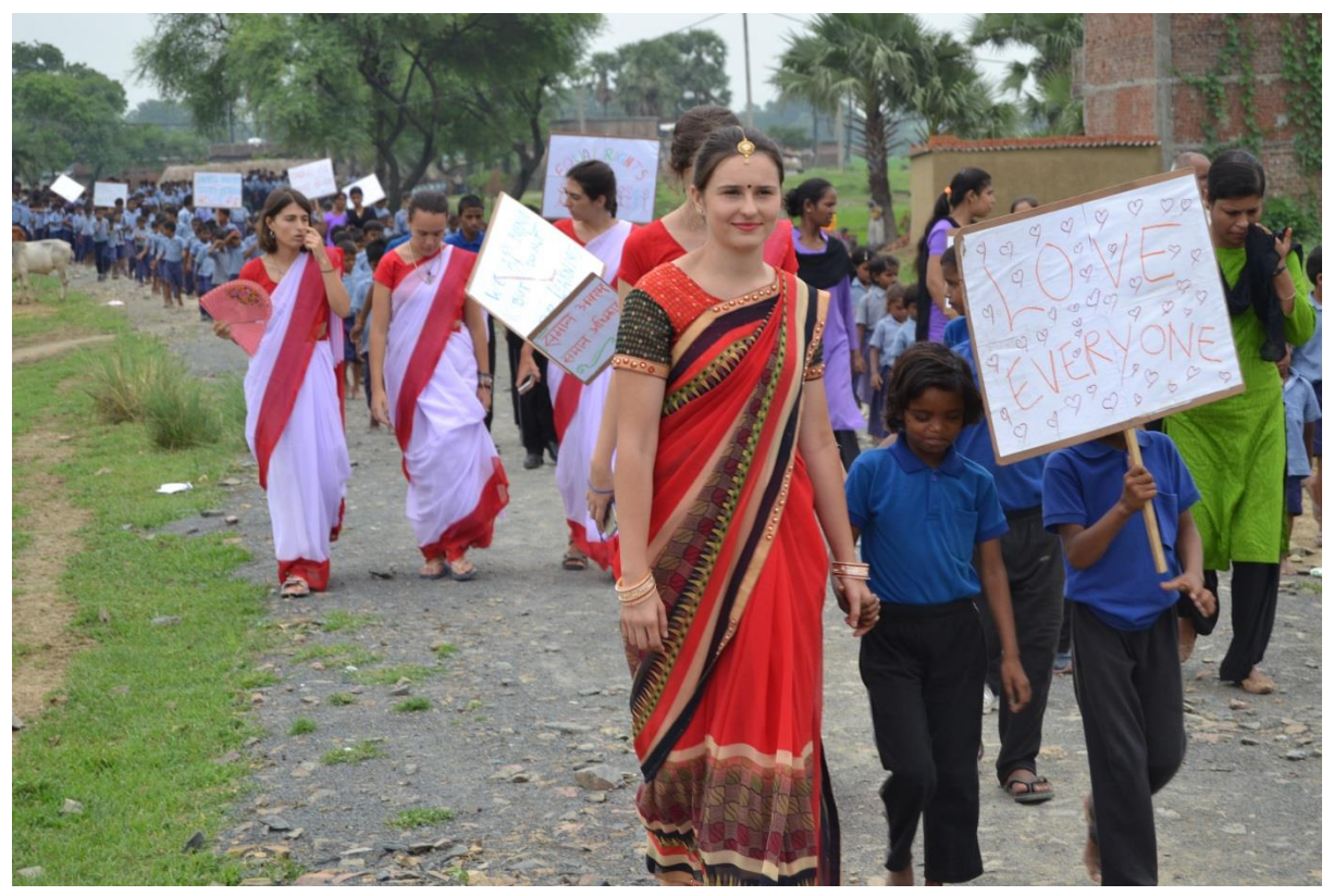
Bodhgaya region of northern India is experiencing rains for the last two months. Parents remain over protective for the children with mental health issues. There is always possibility of risk during these months because they believe these children cannot handle with the rains. Bodhi Tree special school organized a number of rain activities during the past a few months.