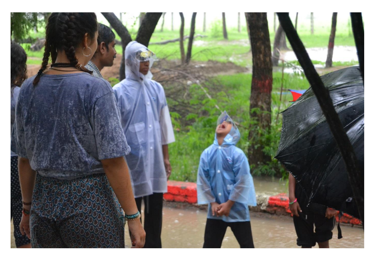
Special Children learning to balance