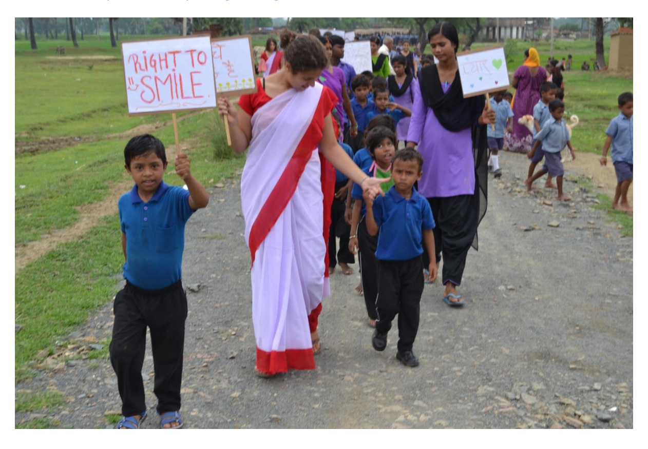
Children with special needs leading the procession