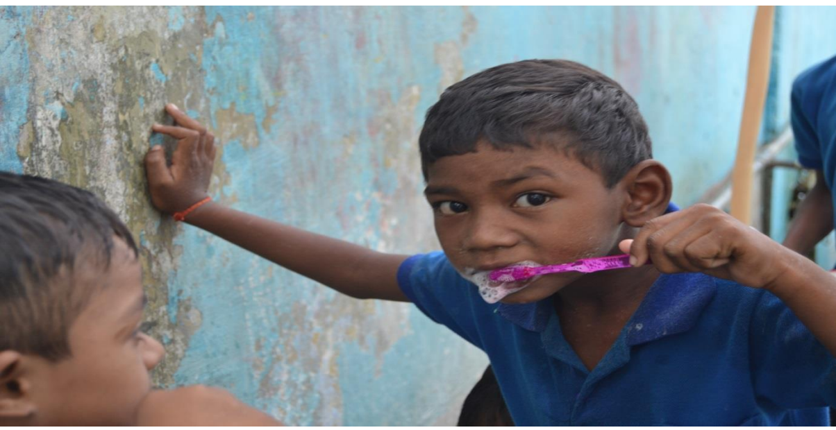
Every such activity is closely guided, evaluated and monitored.