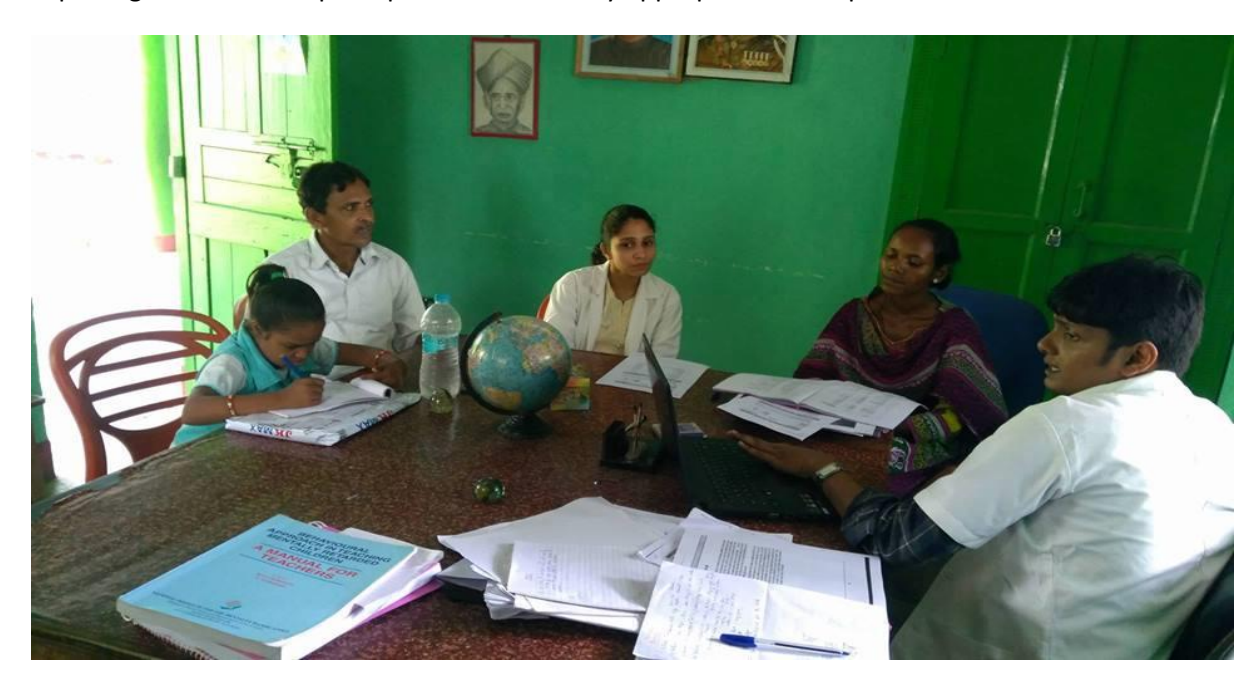
Multidisciplinary team at case study session at Bodhi Tree Special School

Our focus has also been to develop multidisciplinary interventions, disability specific case studies exploring relevant therapies apart from culturally appropriate atmosphere.