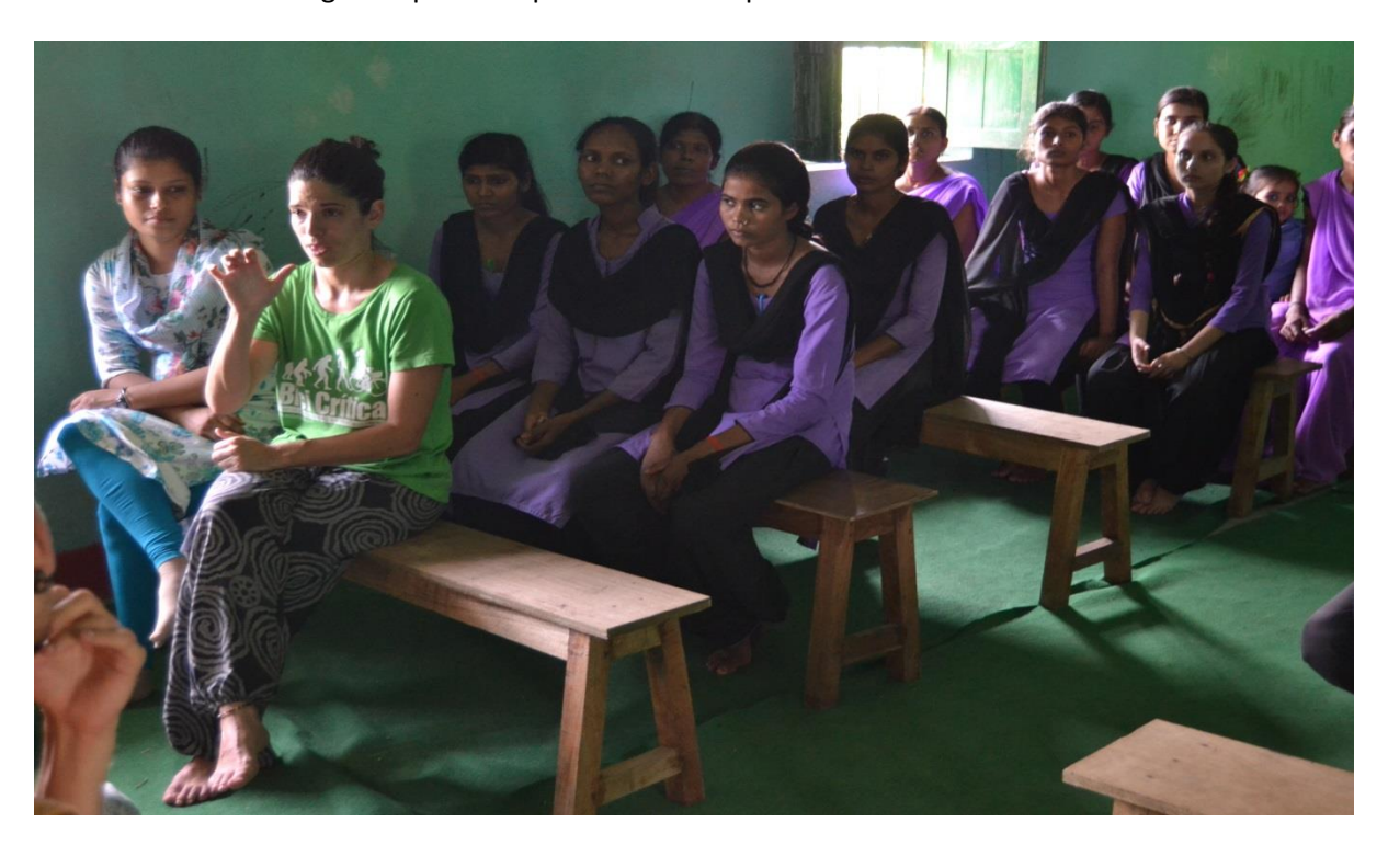
Inclusive Bodhi Tree Family

A workshop was organized for broad understanding of general educators and special educators about children with hearing and speech impairment. The session was guided by three special educators with hearing and speech impairment from Spain.