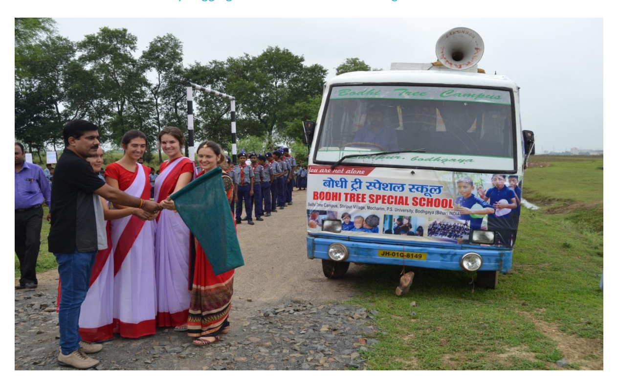
Clinical Psychologist leading the walk of Children to nearby slum like villages