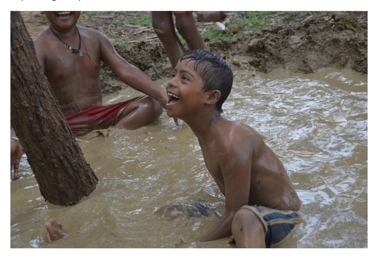
Children with special needs enjoying in a mud pool exploring humor

We have therapies and medicines for them but we are exploring more the indigenous creativity that helps them get deeper into their own communities.