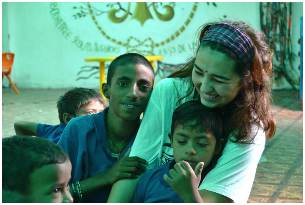
Bodhi Tree Special School