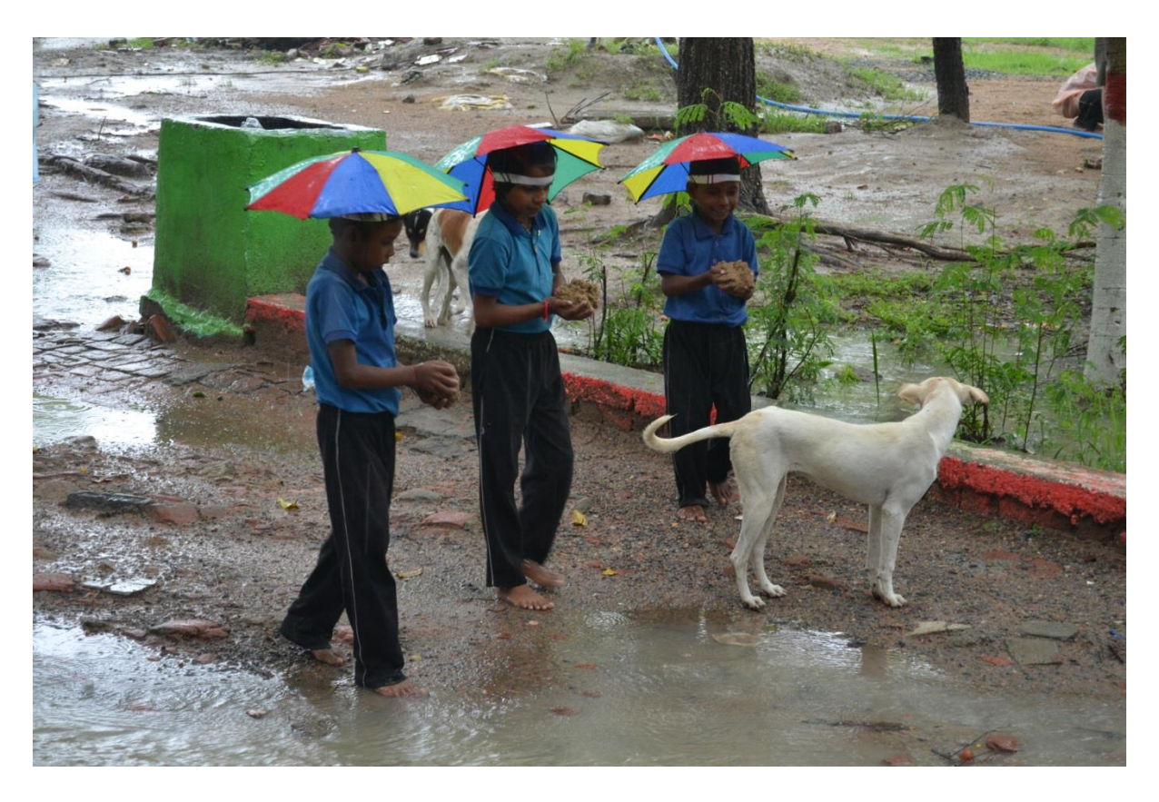
Interation and inclusion