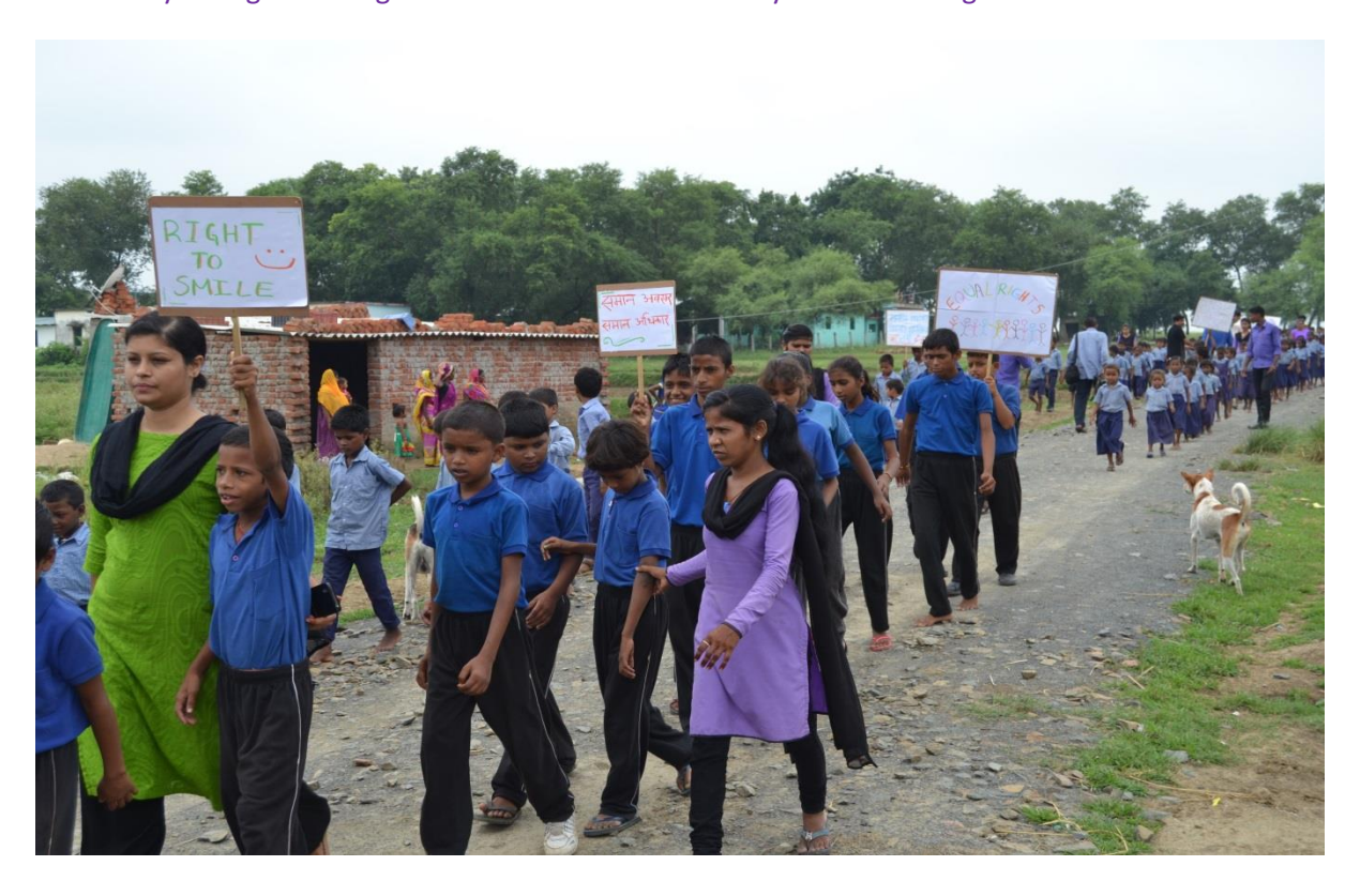
Awareness Drive reaching villages