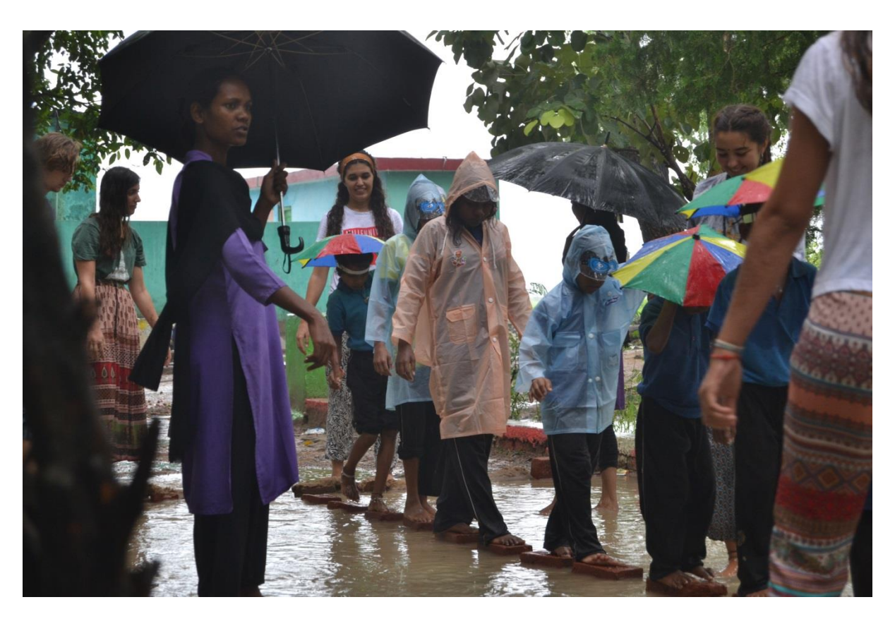
Special Children learning to hold water flow during the rain